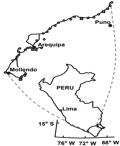
Figure 1: A map of the Peru deployment.

In this deployment, the transect is a collection of forty-nine seismic sensing stations placed at roughly 6km intervals along a line running from the ocean port of Mollendo, across eight plains and seven mountain ranges, and ending 20km northeast of Juliaca near the shore